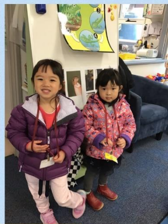
Our helpful Monitors