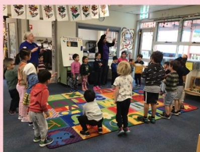
Music and movement