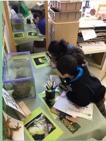
Exploring our Tadpoles