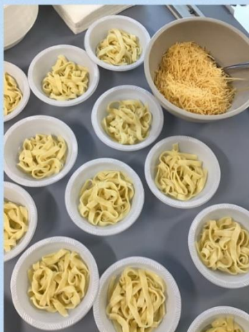
Our pasta cooked and ready to eat