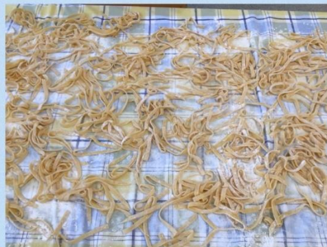
Our pasta ready for cooking